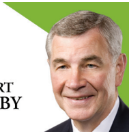
NFHS Executive Director