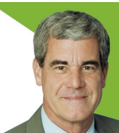
NASO Founder & President