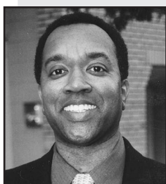
By Donald C. Collins

Q: What sort of training or training materials can a state association give to officials in the state without crossing the "employee" line? We're told that the state would like to provide training for the officials, but can't because they say if they provide training, it makes the state look like its employing the officials instead of allowing them to act as